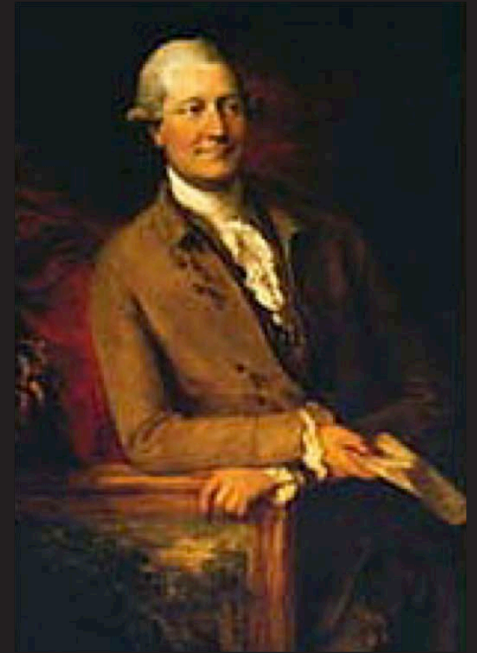
James Christie, 1778

Email: cataloguesubscriptionsnewyork@christies.com